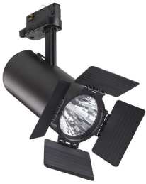
ST315T BK Greenspace accent Projector mini + ST710Z BD BK Barndoor