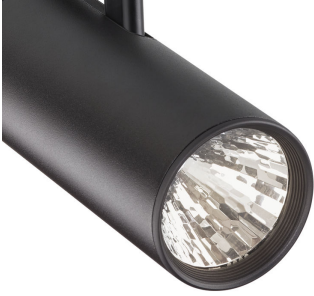
ST315T PSU BK Greenspace Accent Projector mini lens detail