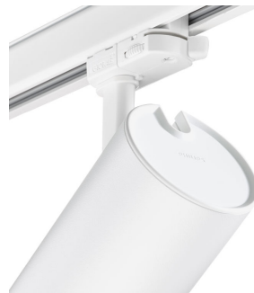
ST315T PSU WH Greenspace Accent Projector mini back view hinge detail