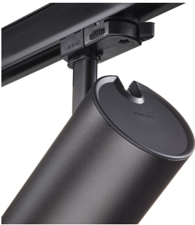
ST315T PSU BK Greenspace Accent Projector mini back view hinge detail