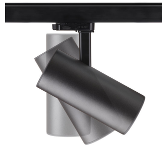
ST315T PSU BK Greenspace Accent Projector mini side view