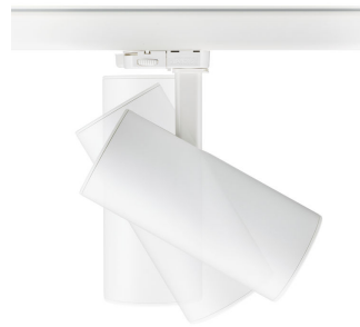
ST315T PSU WH Greenspace Accent Projector mini side view