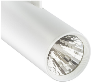
ST315T PSU WH Greenspace Accent Projector mini lens detail