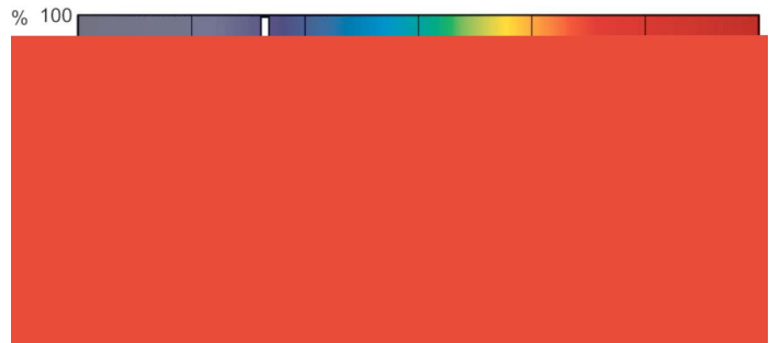
XDPB_XDMSR_SA-Spectral power distribution B/W